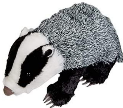
WINNER - Attenborough